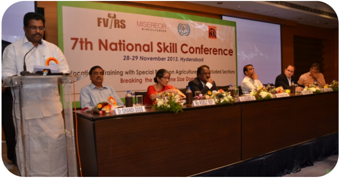
Hon'ble minister Suresh Kodikunnil addressing the participants

The NSC was inaugurated on 28 November, 2013 by Shri Suresh Kodikunnil, Hon'ble Minister of State for Labour and Employment, Govt. of India. In his inaugural address the Hon'ble Minister emphasised on the need for developing huge skilled manpower to the extent of as high as 500 million by the year 2022. This target is not only sky-high but also is complicated because of nearly 85 per cent working population being in the unorganised sector. Government of India at the highest level is seized of this problem and in consideration of this enormous challenge formulated a National Policy on Skill Development in 2009.